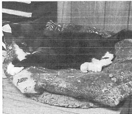
Oreo

We also enjoyed the relationship we developed with the District's resident cat, Oreo. Oreo is estimated to be 25 years old, and she seems to be a great morale builder for the District staff. Plus, she has probably been an excellent "mouser" for them.