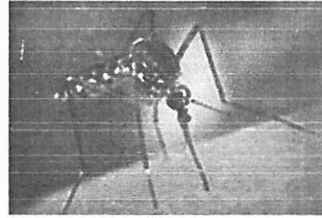
Invasive Aedes Mosquito aka "ankle-biters"

Among the four targeted species, the Aedes mosquito, called the “ankle biter”, is the new species in town. It doesn’t ring the bell, but comes right in for breakfast, lunch, and dinner; bites you as its main course, and comes back for seconds and thirds!